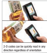
2-D codes can be quickly read in any direction regardless of orientation