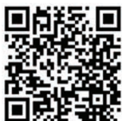
BHT-1300 Web page